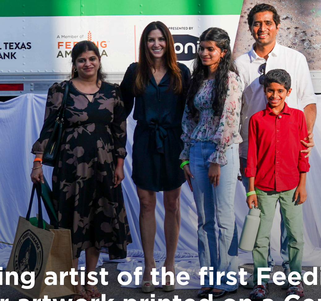
The winning artist of the first Feeding Creativity art competition will have their artwork printed on a Central Texas Food Bank truck. Winning art from 2024 is shown above.