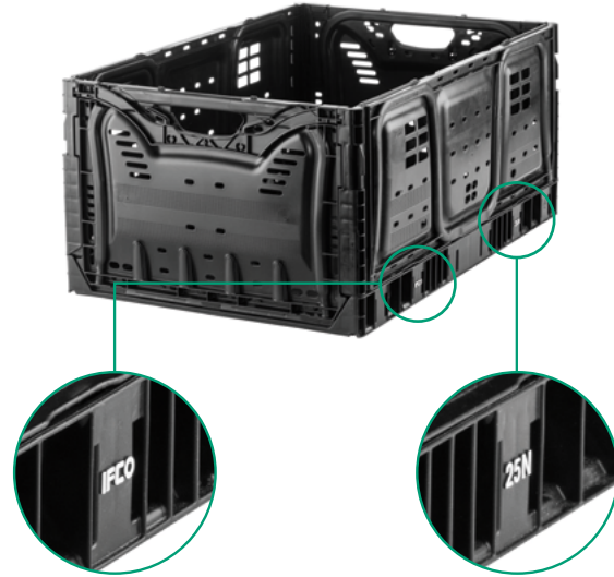
IFCO Logo Stamp Embossed